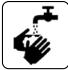
FREQUENT WASHING ON HANDS WITH WATER AND SOAP