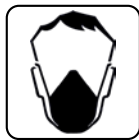
USING THE MASK PROTECTIVE