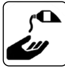
DISINFECTION ON HANDS