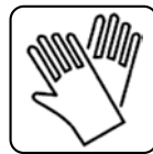
USE OF GLOVES

Failure to comply with the above measures are sanctioned by: